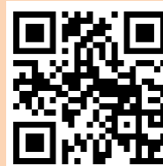
38th In-Nichi Bunkasai